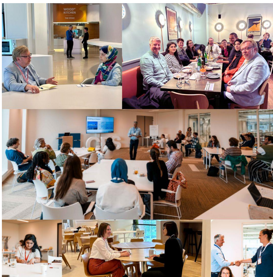
Impressions of the Midway event 2024